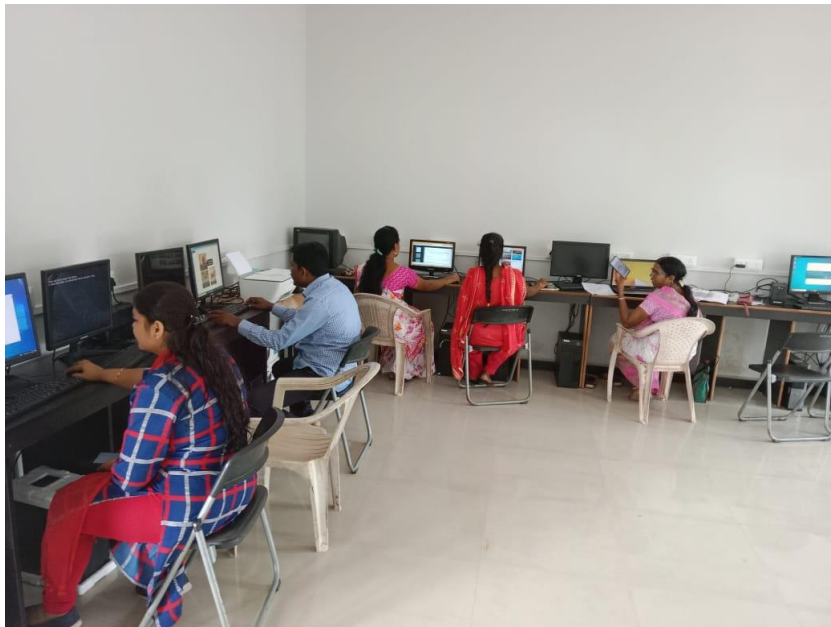
All staff using the MIS