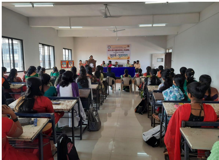
Guidance and well wishes of Principal madam to new students.