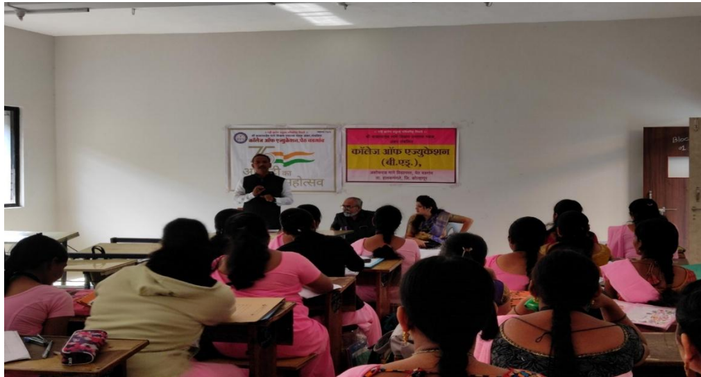
One day workshop of TAIT, CTET