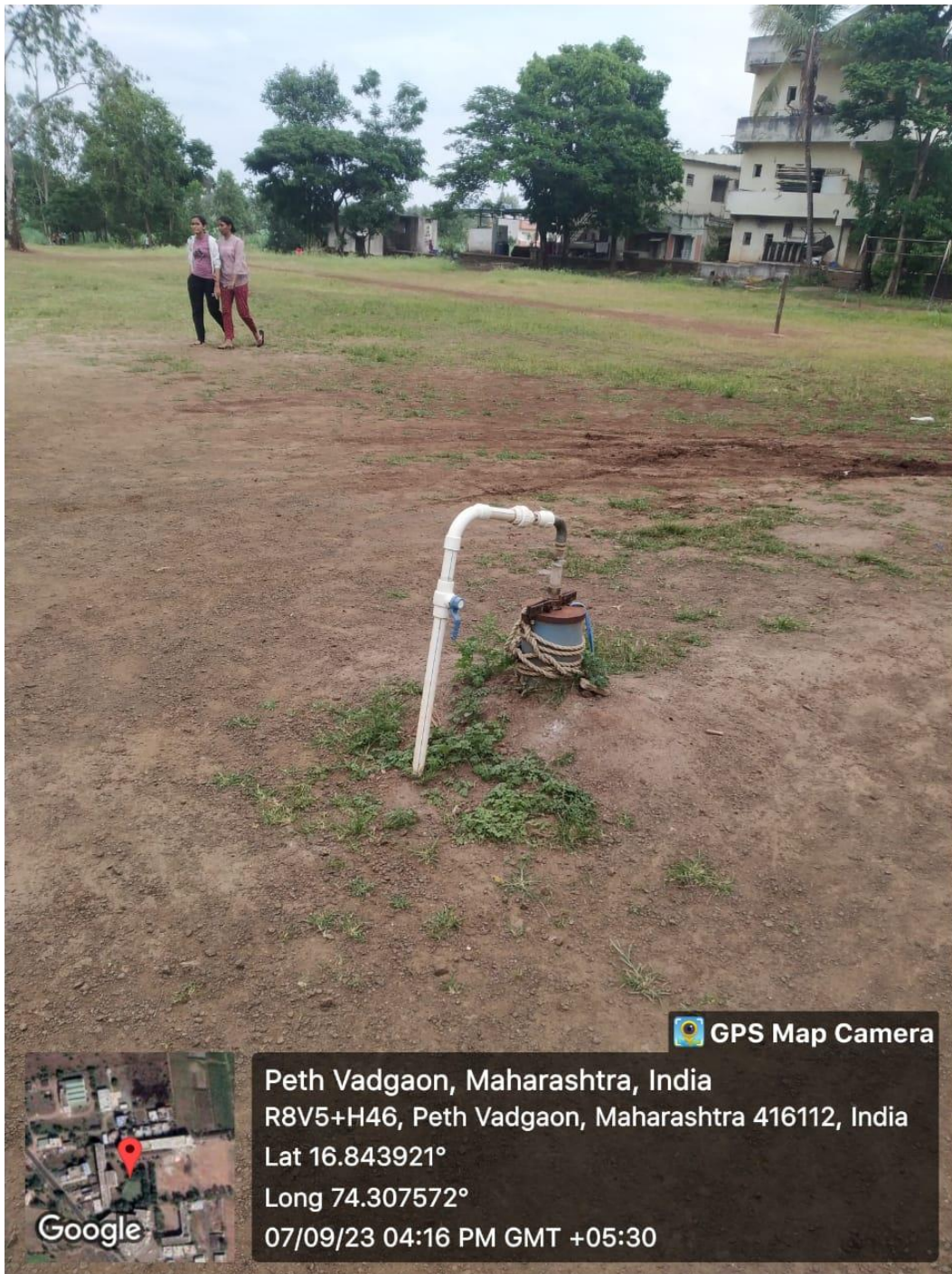
Bore well in college campus