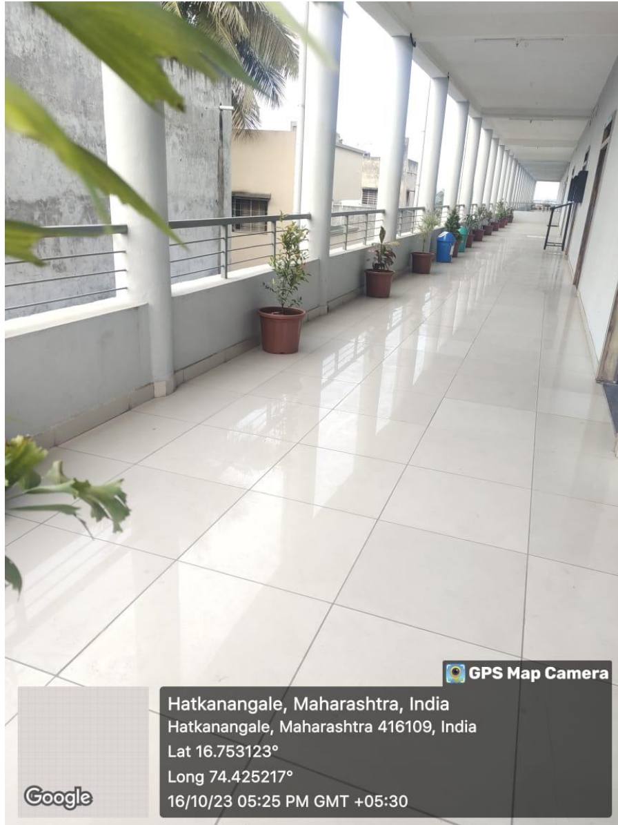
College greeny campus