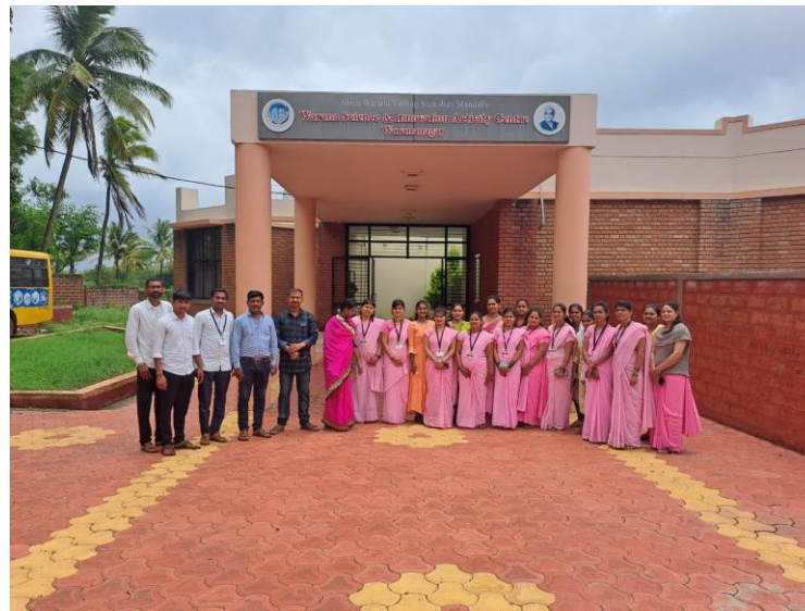
Visit to innovative centers