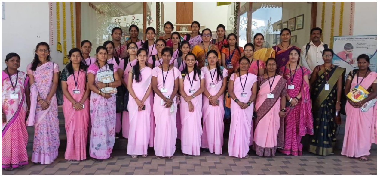
Visit to the innovative school